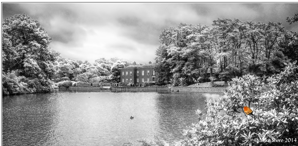
A Christmas robin from Styal visiting Dunham Massey