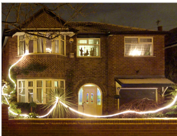
32 Railway Sidings, Timperley