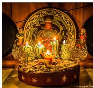
Long gone and 2014 awaiting inspiration, attention, and Rioja