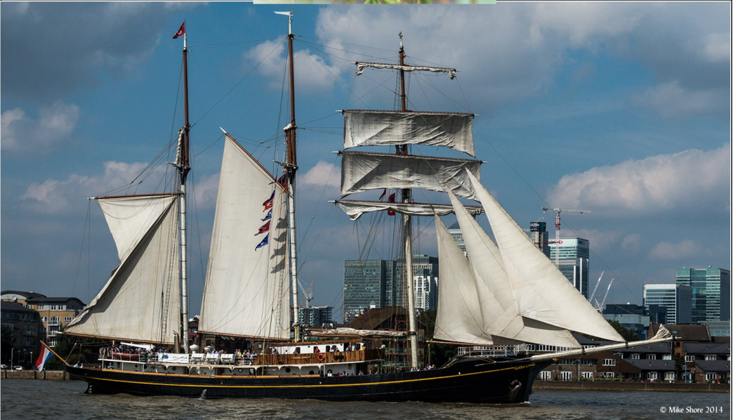
2014 images: Wythenshawe Hall, 'Maple' Canadian Great Horned Owl at Rockcliffe Raptors, the first bloom of the new Dunham Massey rose, Torvill & Dean at Marbury, and the Tall Ships Parade at Greenwich (taken across the Thames on my Sony travel compact)